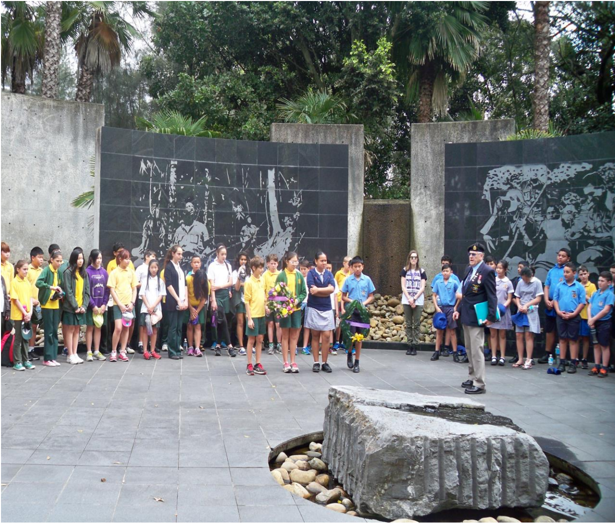
Year 6 at the Kokoda Track.